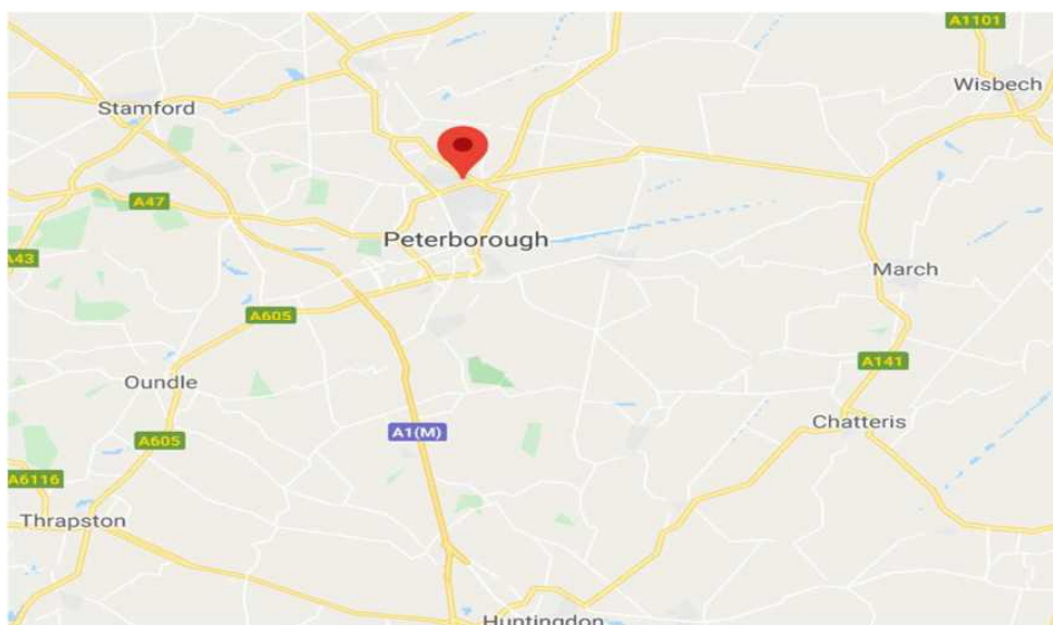
Figure 1: Paston, Peterborough (PCC)