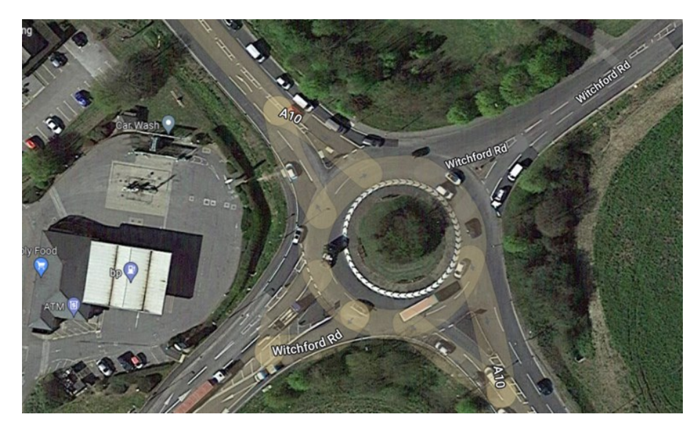
Figure 1: Aerial picture of Lancaster Way roundabout