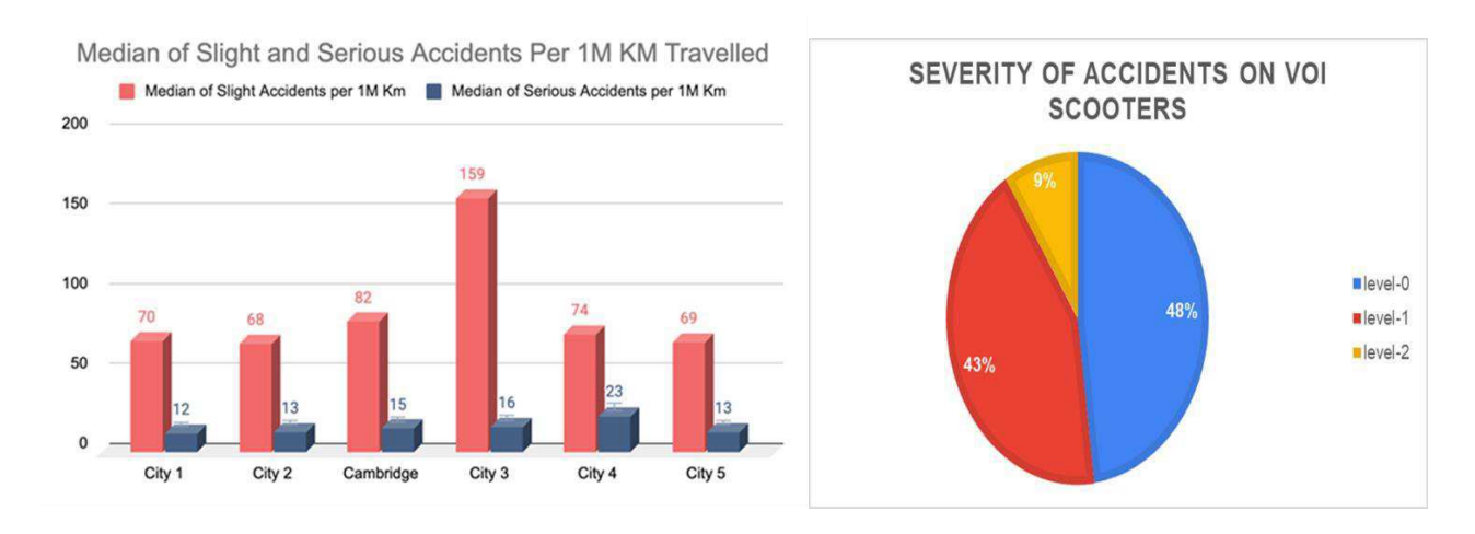
Figure 3 and 4 shows Cambridge City incidents compared to other cities. Figure 4 shows severity of incidents in Cambridge.