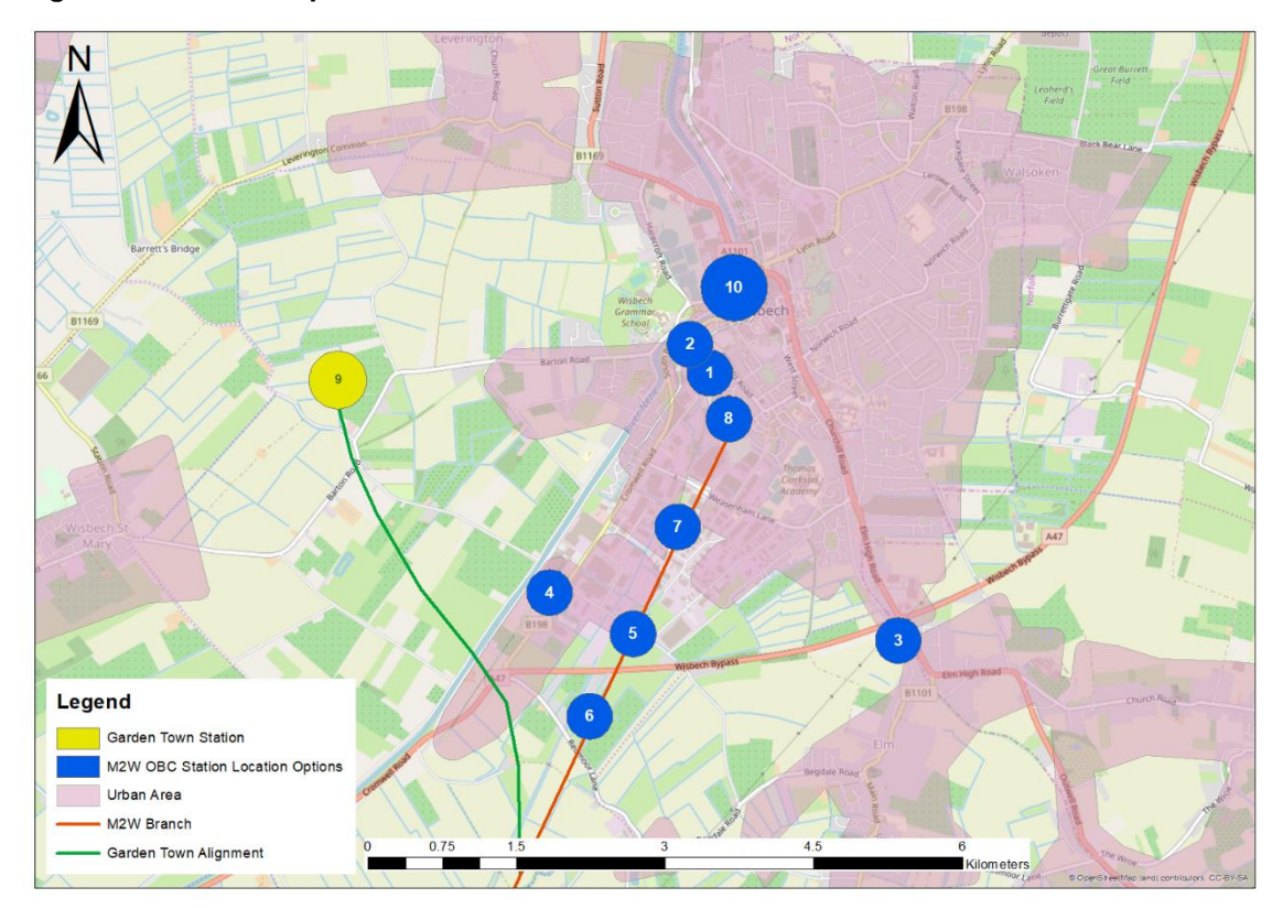
Figure 3.1: Station Options Considered for in Wisbech

with location 10 ("Wisbech Town") being the indicative preferred location for more detailed design assessment.