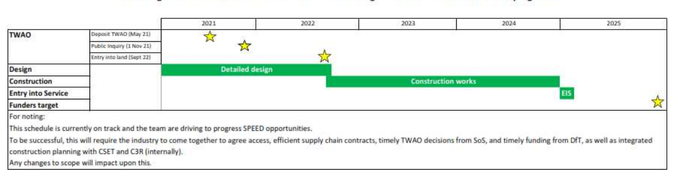
Cambridge South Infrastructure Enhancement - indicative high level overview based on SPEED programme