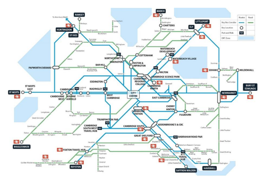
Figure 2 - Future Bus Network 2030

This framework provides the basis for a transformed public transport network that will better connect the places where people currently live and work, as well as encompassing the new and growing areas. This will include more rural connections as well as new routes into employment centres, coupled with more frequent services and longer operating hours. The figure illustrates the Future Bus Network 2030 and shows how contemporary Cambridge with its polycentric employment sites, railway stations and Park & Ride sites will be better connected to the surrounding rural areas.