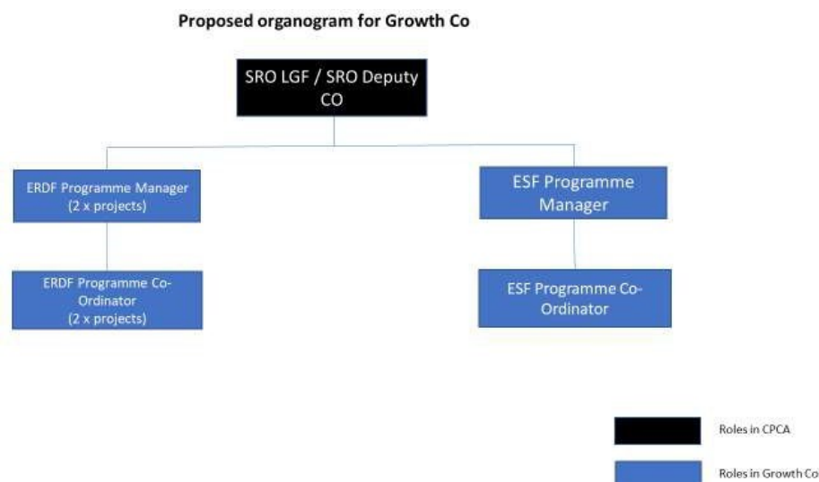
Figure 2 – Proposed full time employed resource in Growth Co

Employed personnel – four ERDF / ESF programme managers & co-ordinators to monitor and contract manage the delivery of the Business Growth service through the procured supplier(s). Refer to table 3 section 6.0.