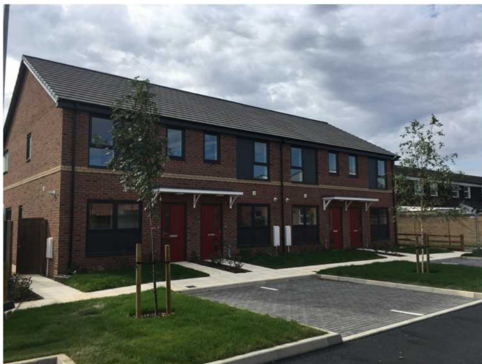
Nuns Way, August 2019