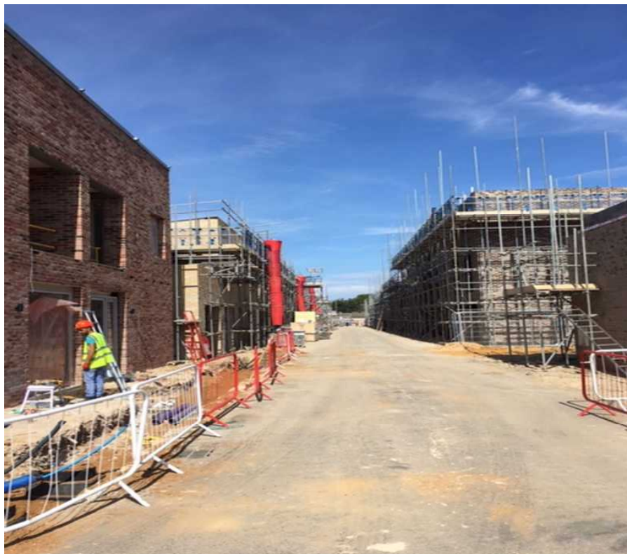
Mill Road, August 2019