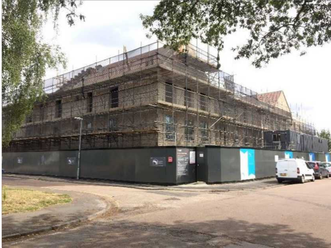
Anstey Way, August 2019