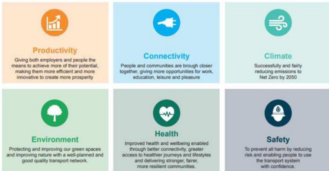
Table 1 LTCP Objectives