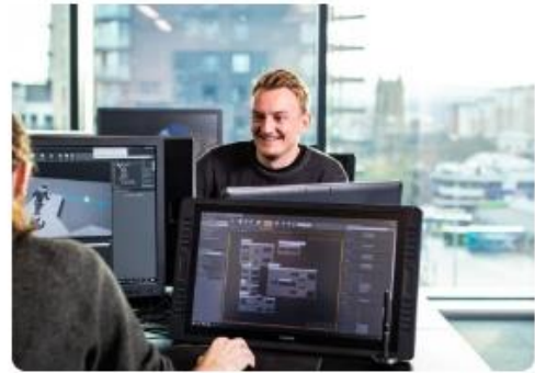
Digital and IT