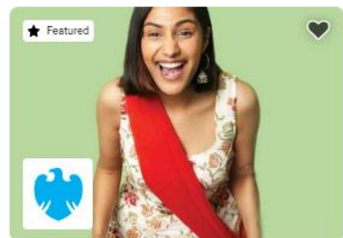
Barclays Bank Plc