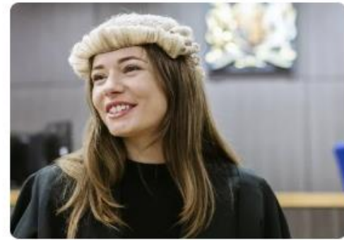
Law and legal studies