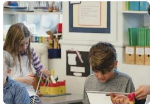
Education, teaching, and childcare