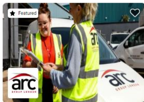
Arc Group London Ltd