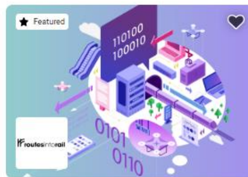
Routes into Rail