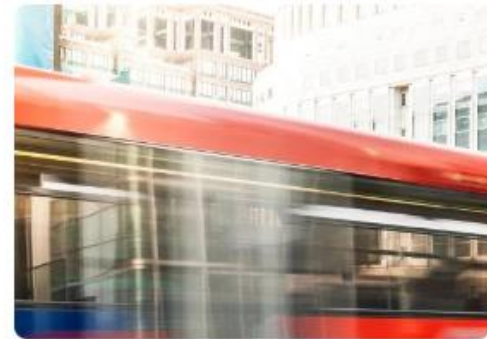
Transport and logistics