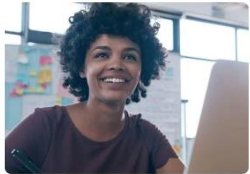
Business and administration