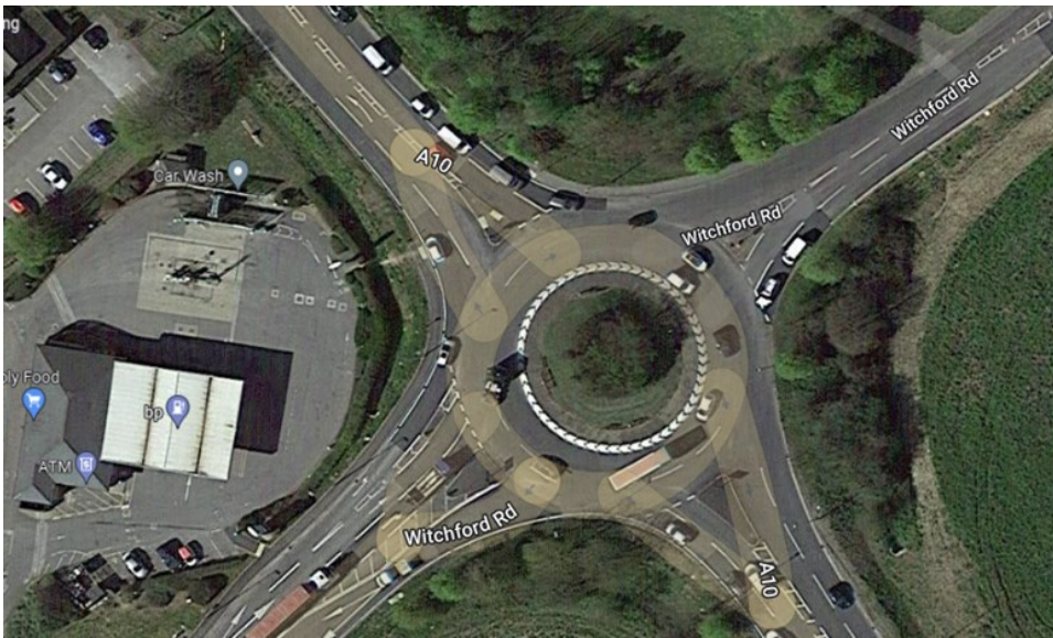
Figure 1: Aerial picture of Lancaster Way roundabout

2.2 The funding sought for this project is intended to engage with CCC via a Grant Funding Agreement (GFA) to enable them to manage and appoint a consultant to investigate and produce a report for potential options, surveys, cost and risks to alleviate this problem.