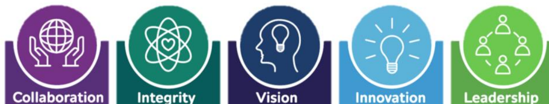
Figure 4 - Civil Values

Our five values ( CIVIL ) are central to our culture, driving everything we do. Our employees embody these values to help us all work toward a common purpose.