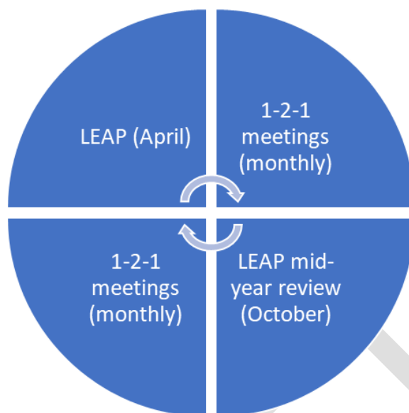
Figure 3 - The Employee Performance Cycle