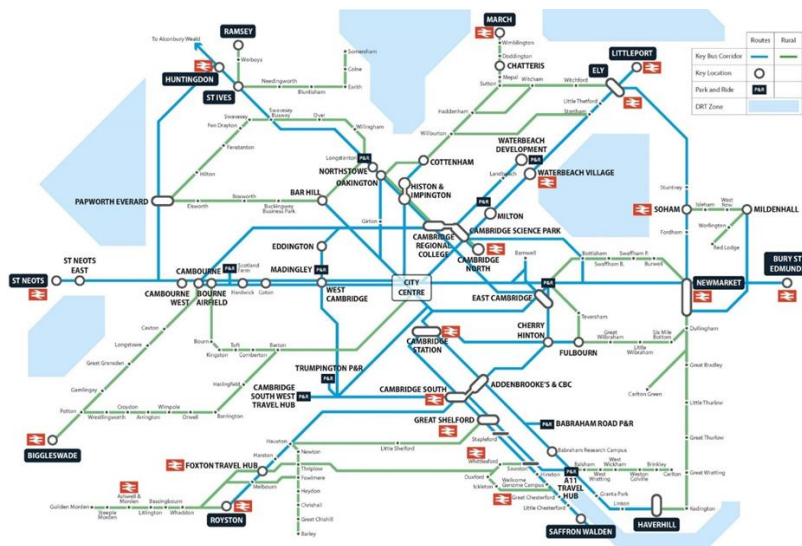
Figure 2 - Future Bus Network 2030

This framework provides the basis for a transformed public transport network that will better connect the places where people currently live and work, as well as encompassing the new and growing areas. This will include more rural connections as well as new routes into employment centres, coupled with more frequent services and longer operating hours. The figure illustrates the Future Bus Network 2030 and shows how contemporary Cambridge with its polycentric employment sites, railway stations and Park & Ride sites will be better connected to the surrounding rural areas.