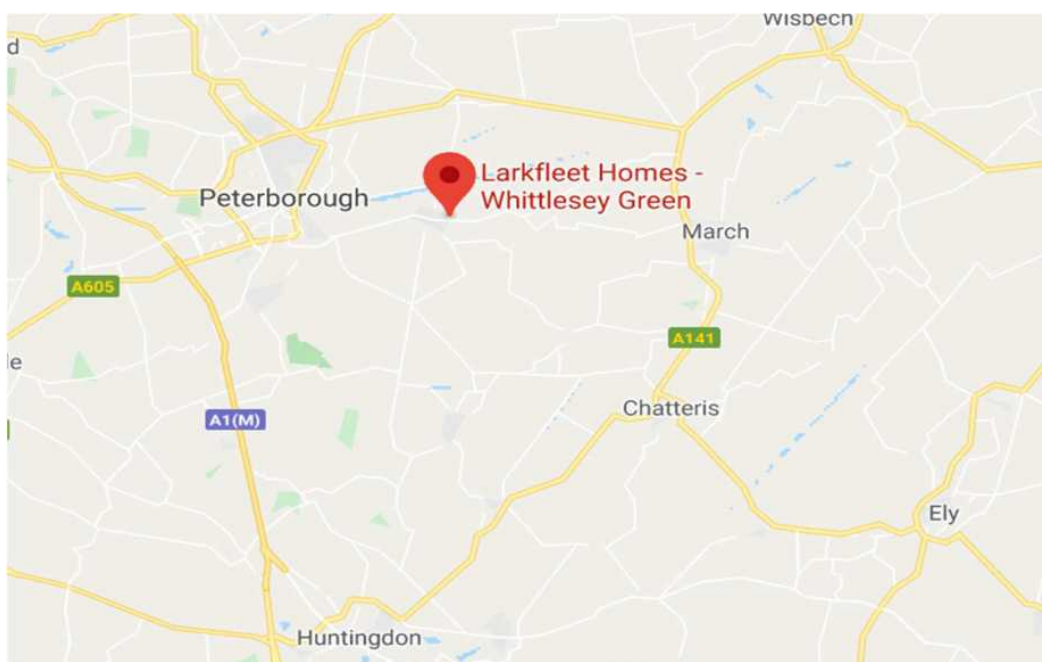
Figure 1: Whittlesey Green, (FDC)