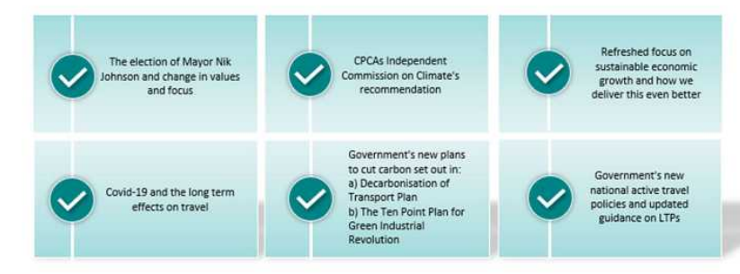
DIAGRAM: Reasons for new Plan-

The diagram below summarises the reasons for the new LTP