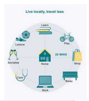
DIAGRAM – similar to above on "live locally, travel less"

Changes in working patterns during the pandemic have resulted in demonstrating the potential of home working to reduce commuter travel and associated emissions. We recognise that home working will not be feasible for many job roles, nor will not be practical for those who lack home environments suitable for work. However, we will look to reduce the need to travel wherever possible with our Planning Authority partners and stakeholders to enable people to live locally and travel less.