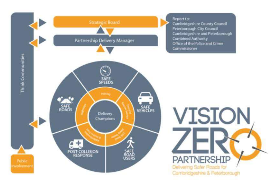
DIAGRAM - VISION ZERO PARTNERSHIP

We will continue to work closely with the Cambridgeshire and Peterborough Vision Zero Partnership to achieve our overarching safety goals – with regular direction given to and from the Combined Authority Board.