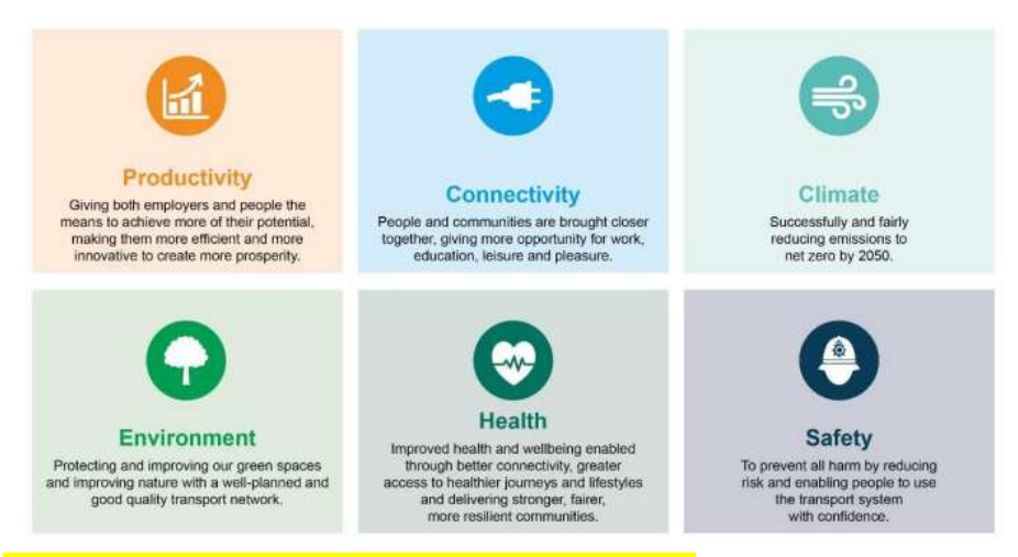
DIAGRAM - Goals of the Local Transport and Connectivity Plan

These six goals have been developed from the three outlined previously in the LTP (Economy, Environment and Society) and are: