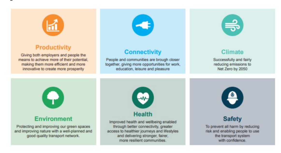
Table 1 LTCP Objectives