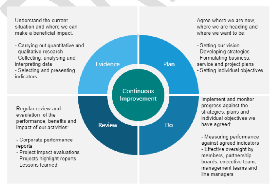
Figure 1 - Evidence, Plan, Do, Review model

We will approach performance management as a continuous cycle, based on an Evidence, Plan, Do, Review model. We will collect, analyse and interpret information. We will create insights and make judgements to understand the links between cause and effect. Based on this understanding, we will take decisions, make plans and act on our decisions. Then we will collect further data to learn and review. This is illustrated in Figure 1.