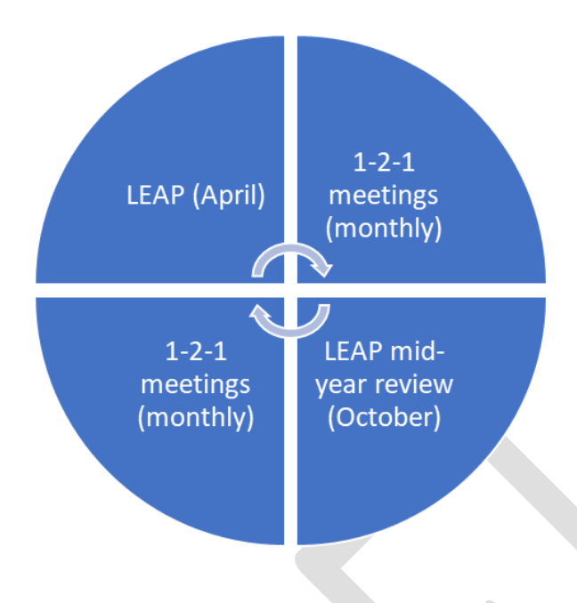
Figure 3 - The Employee Performance Cycle