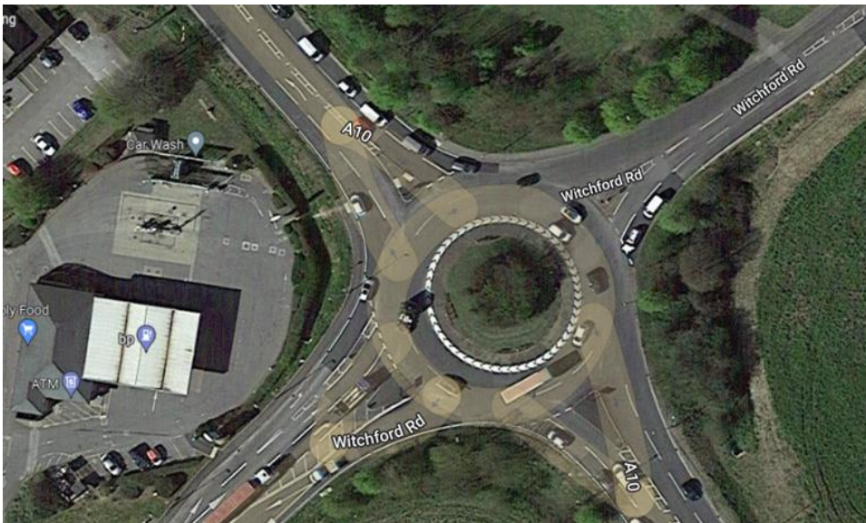
Figure 1: Aerial picture of Lancaster Way roundabout